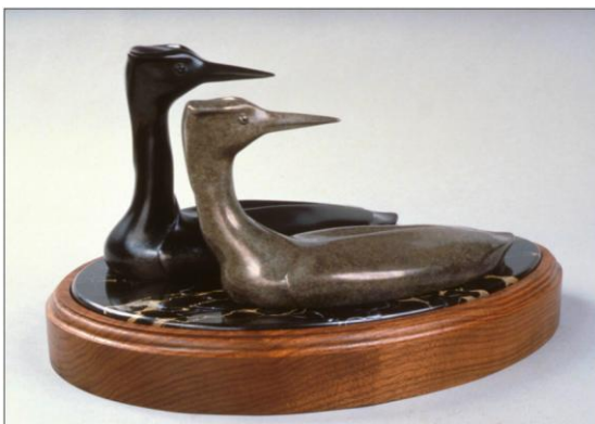
Burt Brent, Bronze, "Gliding Grebes"