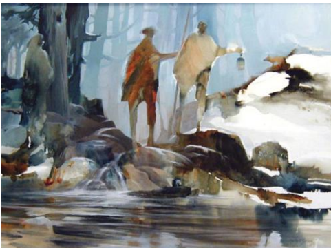
Morten Solberg, Watercolor/Acrylic, "Visit to the Fox Den"