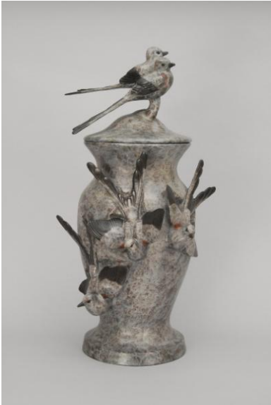
Gerald Balciar, Bronze, "Burst of Spring"